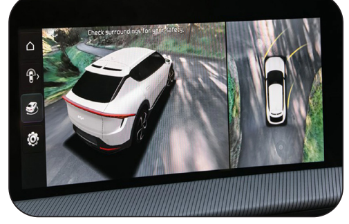
360° Surround View Monitor<sup>12</sup>