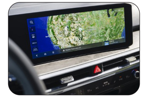
12.3" Info Screen<sup>3</sup> with Wireless Apple CarPlay<sup>5</sup> and Navigation<sup>2</sup>