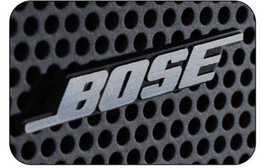
Bose Premium Audio