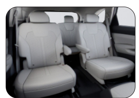
2nd Row Captain Chairs