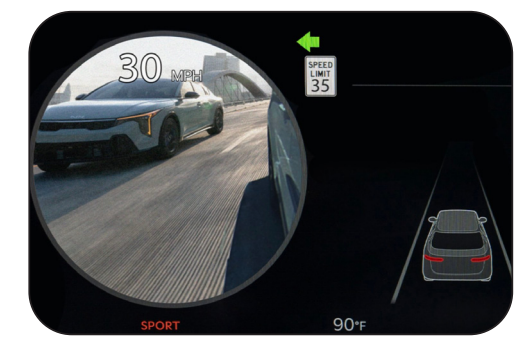
Blind-Spot View Monitor<sup>13</sup>