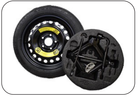
Compact Spare Tire