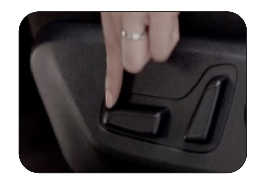
Front Power Seats