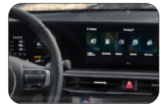
Dual Panoramic Display <sup>3</sup> (12.3" IP +12.3" Touchscreen)