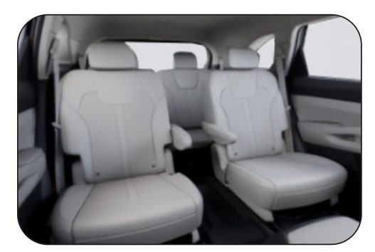
Heated 2nd Row Captain's Chairs